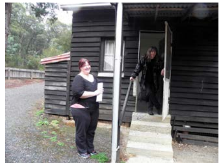
Looking at the Forestry Huts