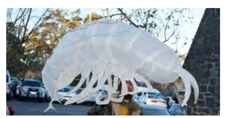
This giant Sherbrooke Amphipod was featured in the Belgrave Lantern Festival a few years ago.