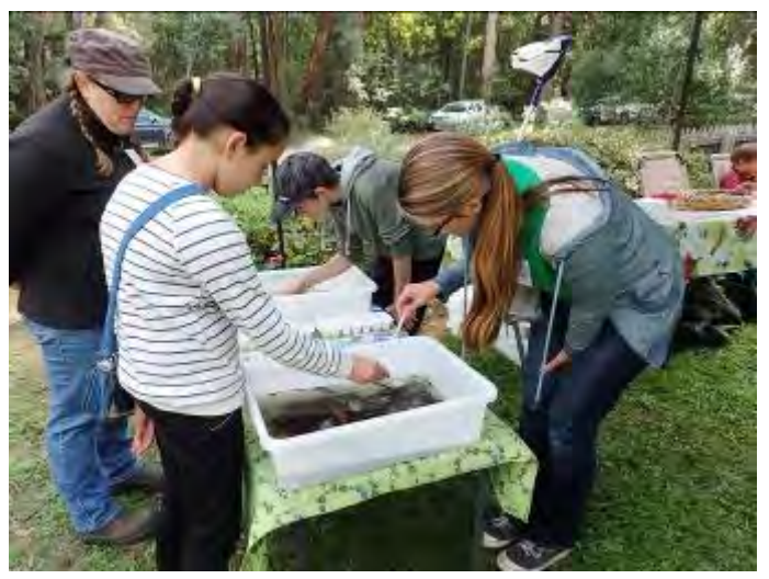
At the 2016 Festival, there was an opportunity to explore the life in a bucket of water from Tomahawk Creek. With some tuition, these keen young scientists could have identified any Sherbrooke Amphipods in the sample by their 'white-eyes'.

The image above has been copied from the electronic version of the Action Statement for the threatened Sherbrooke Amphipod. The x8 magnification factor is therefore not necessarily accurate; the creature is 1—1.65 cm long.